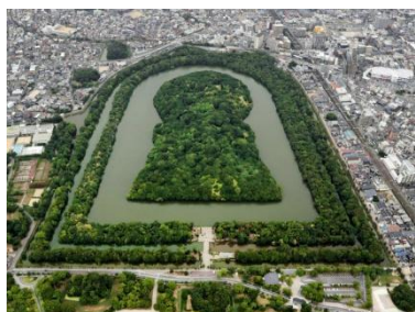
Tomb of Emperor Nintoku

Mozu Mounded Tombs Visitor Center → Tomb of Emperor Nintoku (worship place) ⇒ along the moat → Kitsuneyama Kofun → Dōgameyama Kofun → Empress Iwanohime's Memorial → Hinotani Kofun → Hill of the "First Frost" → Maruhoyama Kofun → Earthen bridge and dam → sight of Nagayama Kofun while walking West → Chayama → Iron gates → Water inlet → Daianjiyama Kofun → Mikunin Square → Genemonyama Kofun → Tsukamawari Kofun → Osamezuka Kofun → Mozu Mounded Tombs Visitor Center