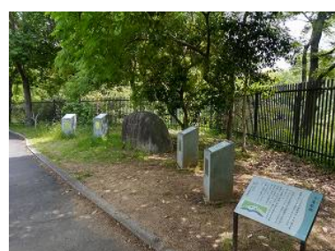
Monument to Empress Iwanohime's poem