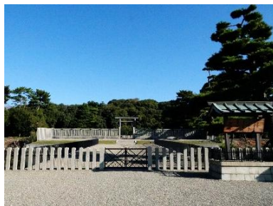
Tomb of Emperor Nintoku (worship place)